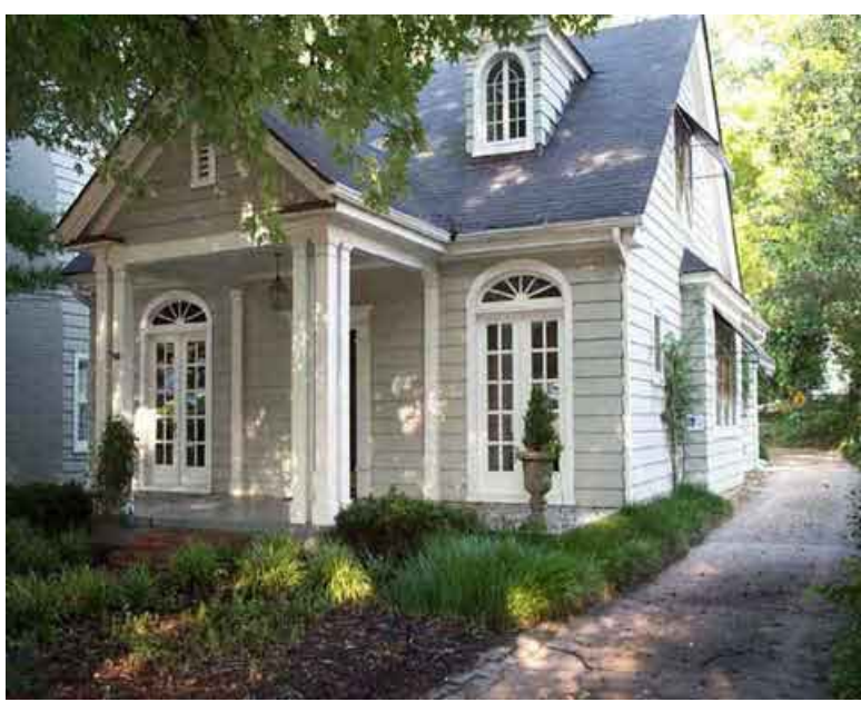
Time Together Visitation and Administrative Offices